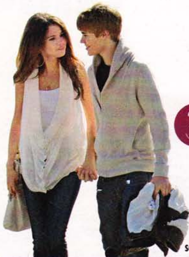
selena gomez & justin bieber