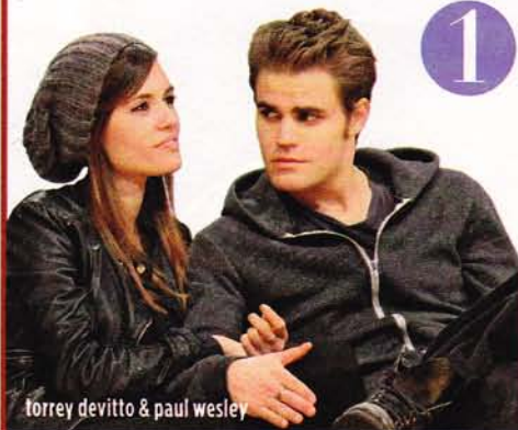
torrey devitto & paul wesley

These hot celeb guys are using their best moves. Can you tell what they really mean?